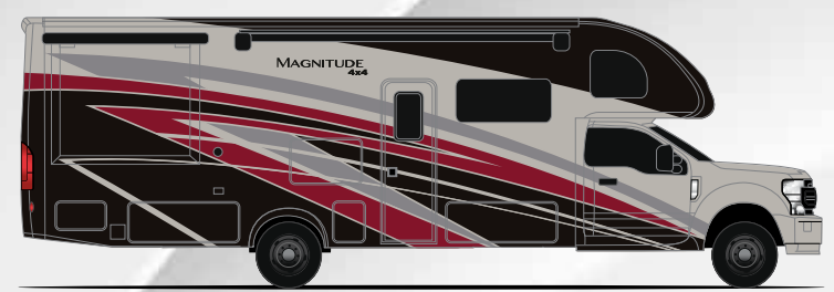
CANYON RIM 3