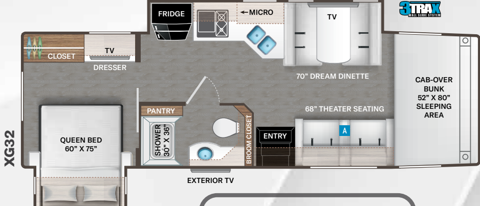
Option Available on Select Floor Plans: