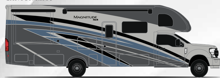
LAKE HAVASU 3