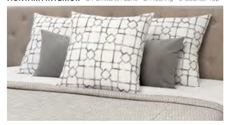
MONTARA INTERIOR a. Furniture/Fabric b. Flooring c. Counter Top