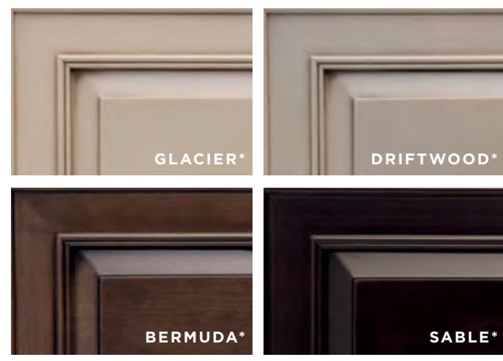
*Available in Matte or High Gloss Finish