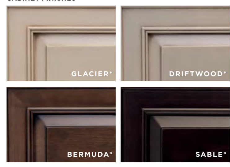
*Available in Matte or High Gloss Finish