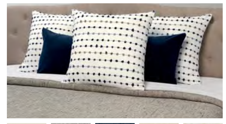
BALBOA INTERIOR a. Furniture/Fabric b. Flooring c. Counter Top