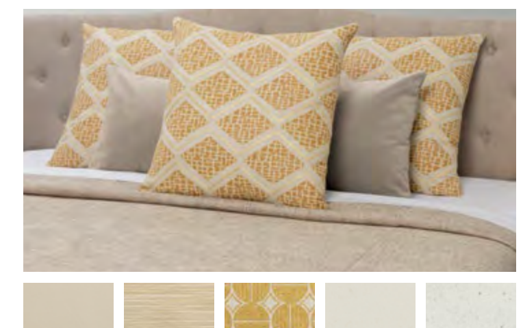
*Exterior colors and interior décor options can be matched to customer preference.