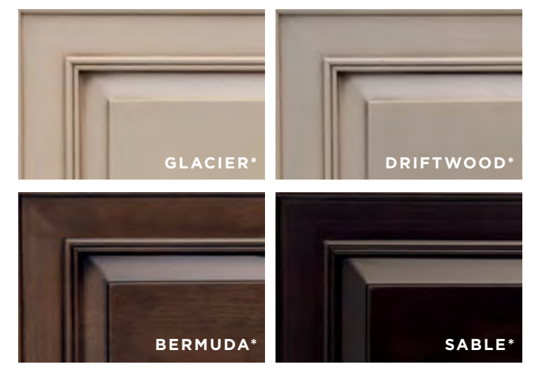
*Available in Matte or High Gloss Finish