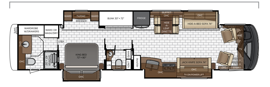
Length: 44′ 10″