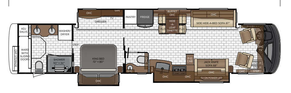
Length: 44′ 10″

Length 44' 10" Width 101.5" App. Overall Height 13' 04" Interior Width 95.5" Interior Height 83"