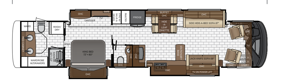
Length: 44' 10"

Length 44' 10" Width 101.5" App. Overall Height 13' 04" Interior Width 95.5"