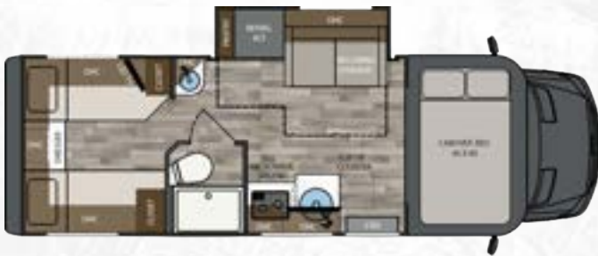
25TBC | 25' TWIN BEDS W/ CABOVER BUNK