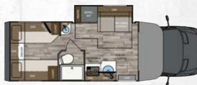
25TBN | 25' TWIN BEDS W/ CABOVER STORAGE