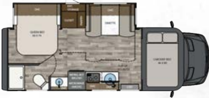
25FWC | 25' FULL WALL SLIDE W/ CABOVER BUNK