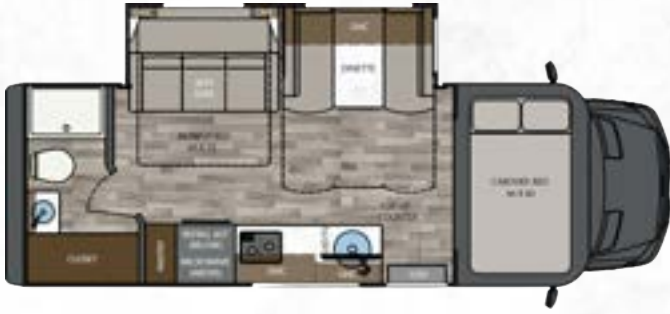
25RMC | 25' MURPHY BED W/ CABOVER BUNK