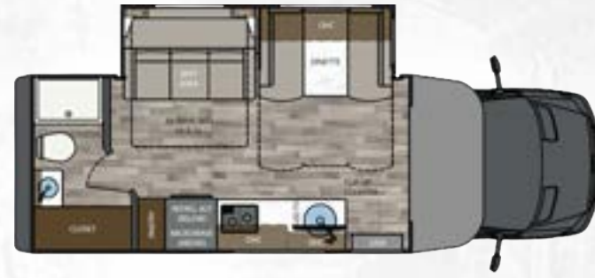
25RML | 25' MURPHY BED W/ CABOVER STORAGE