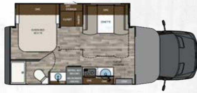
25FWS | 25' FULL WALL SLIDE W/ CABOVER STORAGE