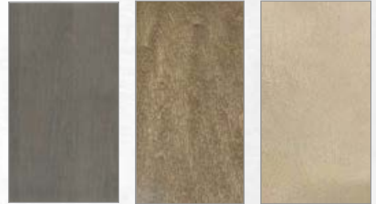
ROCKPORT LAKEWOOD CAPE COD