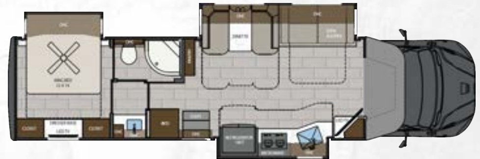
38LDG | 38' MID BATH, 3 SLIDES