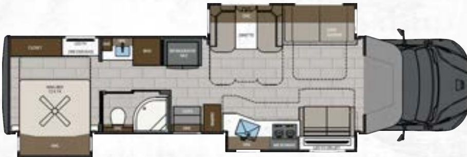
40LTS | 40' MID BATH, 3 SLIDES