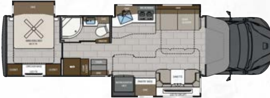
37LMB | 37' MID BATH, 3 SLIDES