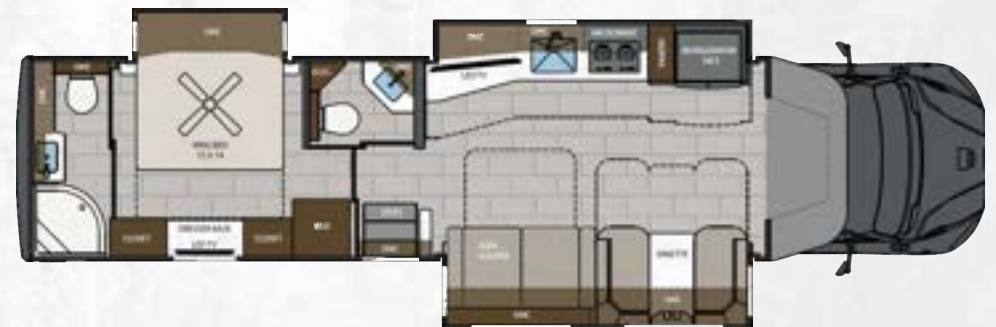
40LRB | 40' BATH AND A HALF, 3 SLIDES